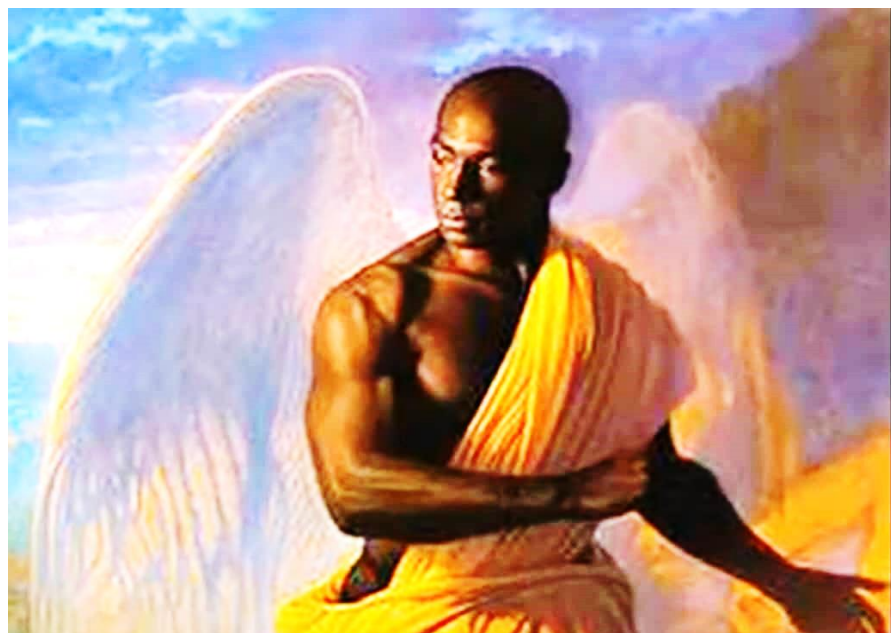
Figure 6: Male person with wings

The church walls inside, it was observed, was decorated with various mystical creatures. There were winged angelic features with black African faces and features, pictures of cows, spears and sticks, drums etc, which apparently inform the mystical reality in the belief systems of Bachwezi-Bashomi.