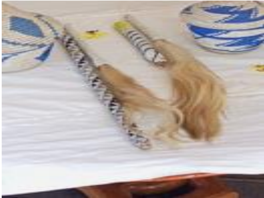
Figure 19: Ikinga (The white trail)

Whenever Bachwezi Bashomi carry out overnights, followers are given specially prepared herbs and concoctions at the itambiro (shrine) and Omuringa (iron bangle or bracelet worn on the wrist) is put on every member by the leader. This bangle is for physical and spiritual healing as well as protection. “Chairman” says that to him, he uses his bangle or bracelet to purify water for healing. Respondents further revealed that Bachwezi Bashomi celebrate religious days according to other religions they were individually converted to, for example Friday if majority are Muslims, Sunday when they are Christians and so forth.