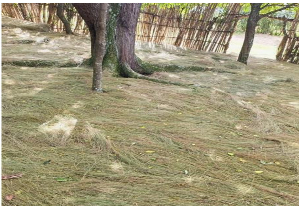
Figure 10: Eyojwa grass in Ekigabiro

nothing can be equated or substituted for this grass. He further reveals that special hides and skins are also used. They are mainly used in people's homes especially of affluent economic status. The Bachwezi Bashomi kneel or sit stretching their legs or sometimes stand head-bowed during prayers. They sometimes bend putting hands on the chests as a sign of respect to God and deities.