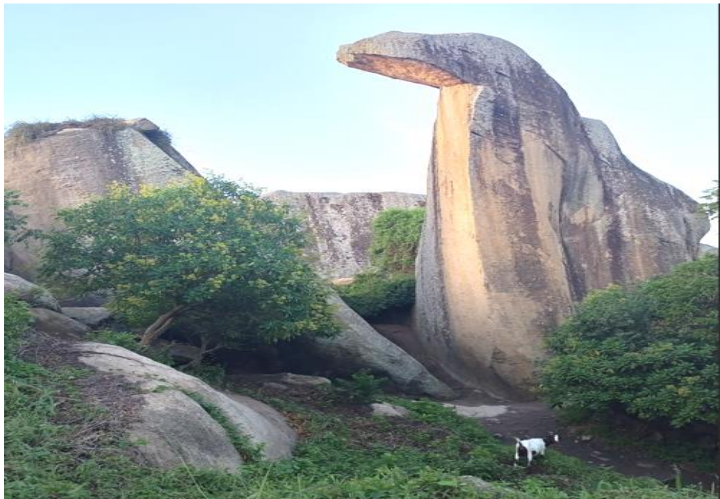
Figure 3 :Maama Mugore in Kiruhura

Figure 1 and Figure 2 are Ebigabiro which are improved or renovated. They are both sacred places found in Mbarara and Kiruhura respectively.