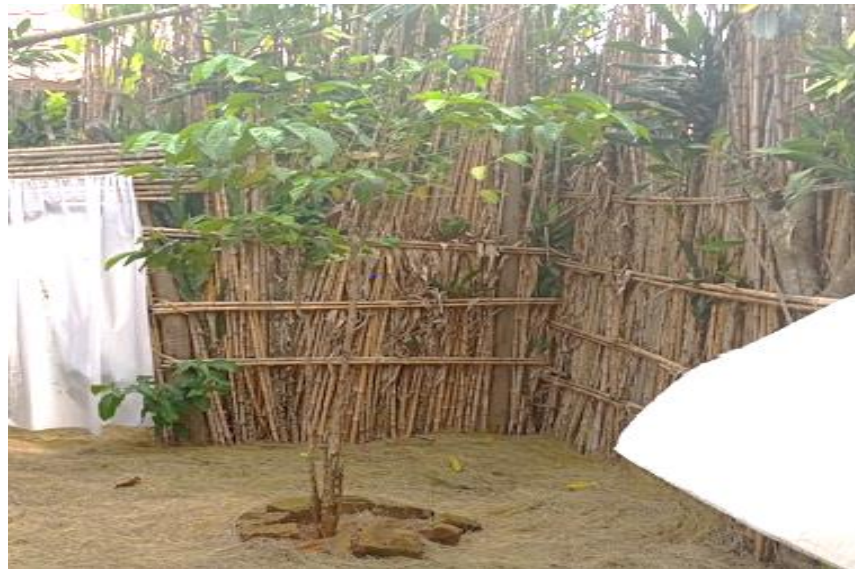
Figure 17:Coffee tree in the middle surrounded by stones and Omugorora in the fence Shrine used in creating better relationship

Fire seems to play an essential role in the Bachwezi Bashomi beliefs and practices both spiritual and physical fire is used by Bachwezi Bashomi as seen