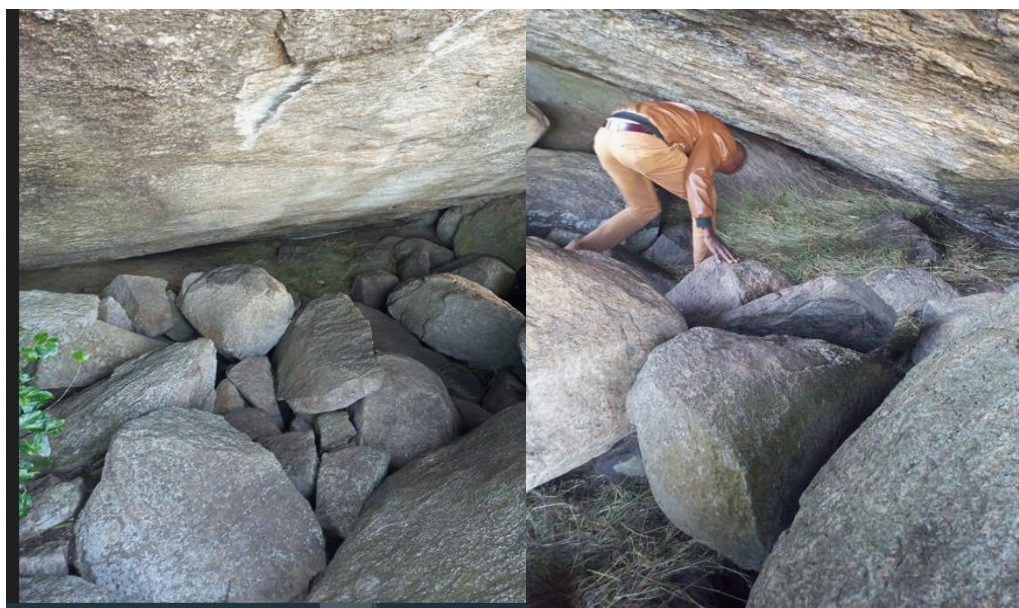
Figure 14: Is a place called parliament in the middle of Mugore Shrine/Ekigabiro.

To this place, politicians visit to make consultations with the Bachwezi spirits and get blessings to succeed in politics