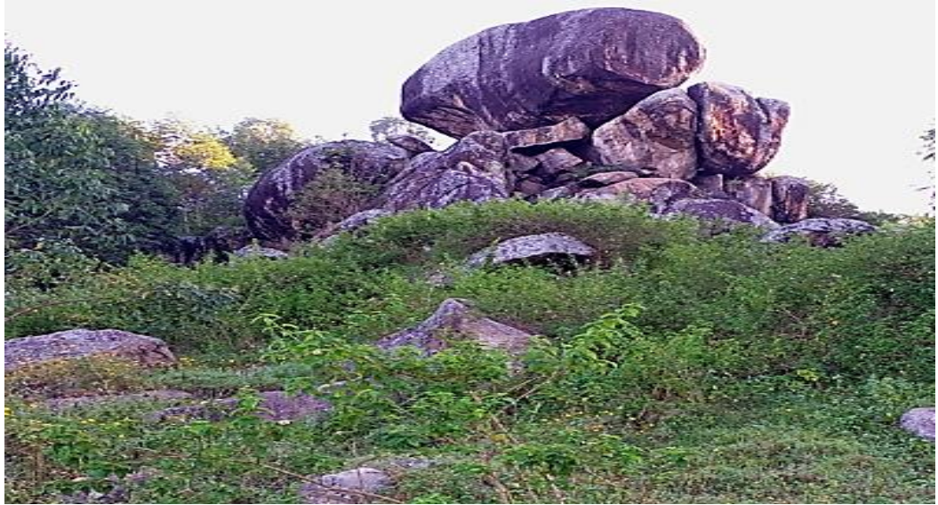
Figure 4: Karegyeya Rock Ekigabiro

Figure 3 and 4 are Ebigabiro which are natural rocks. They are both sacred places found in Western Uganda.