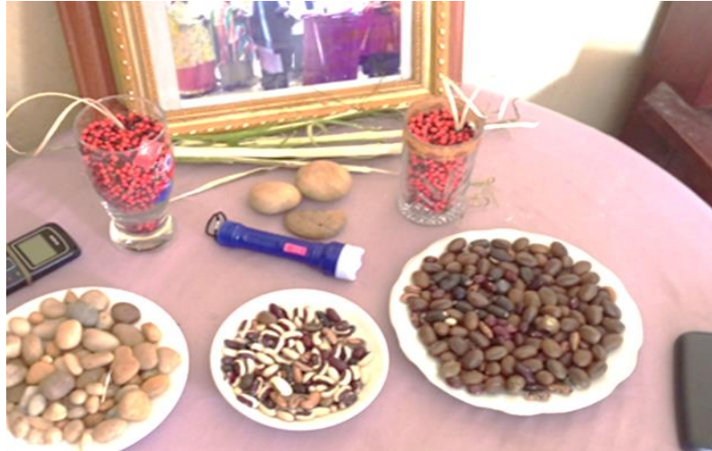
Figure 16:Some of the seeds in the sitting room of a member, which include Coffee, Oburunga red in colour and other seeds used for protection, healing and bringing peace (Obusingye)

Other plants like coffee trees are also believed to possess divination powers. Coffee seeds are believed to enhance the spiritual equilibrium with the spiritual realities.