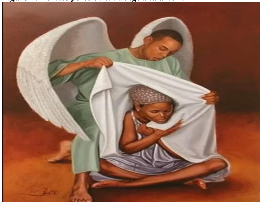
Figure 8: Youthful angelic male covering/comforting a youthful woman