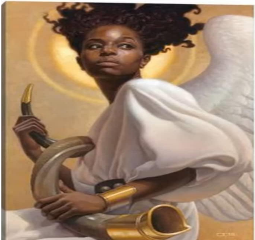
Figure 7: Female person with wings and a horn