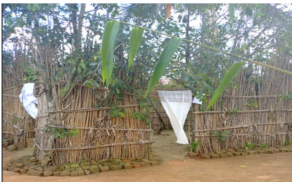
Figure 1: Ekgabiro in Mbarara

The Bachwezi ancestral spirits are central in the religious beliefs of Bachwezi Bashomi. There is a belief that these spirits are the angels and can possess an individual member of the community to reveal the divine message. The Bachwezi spirits are believed to be inhabited within nature like in rocks, waters and trees. As such some rocks and big trees are sacred places where pilgrimages, worship and veneration take place. These sacred places are also known as Ebigabiro (singular Ekgabiro ), Nyaruju , itambiro or omuriinzi and Omutooma Trees. Such sacred places include Bigo-byamugyenyi in Sembabule, Maama Mugore in Kiruhura, Itaaba in Mbarara, Karegyeya in Ntungamo, Bugona in Rubaare, Ntungamo, Nyakahondogoro in Ibanda, Lake Nyabihoko in Ntungamo and Nyakahima tree in Mubende. In all these sacred places, women are not allowed to visit when not pure for example during menstruation period (Namara 2023). Some of the sacred sites have been renovated, while others have remained in their natural form as illustrated in the figure 1 below: