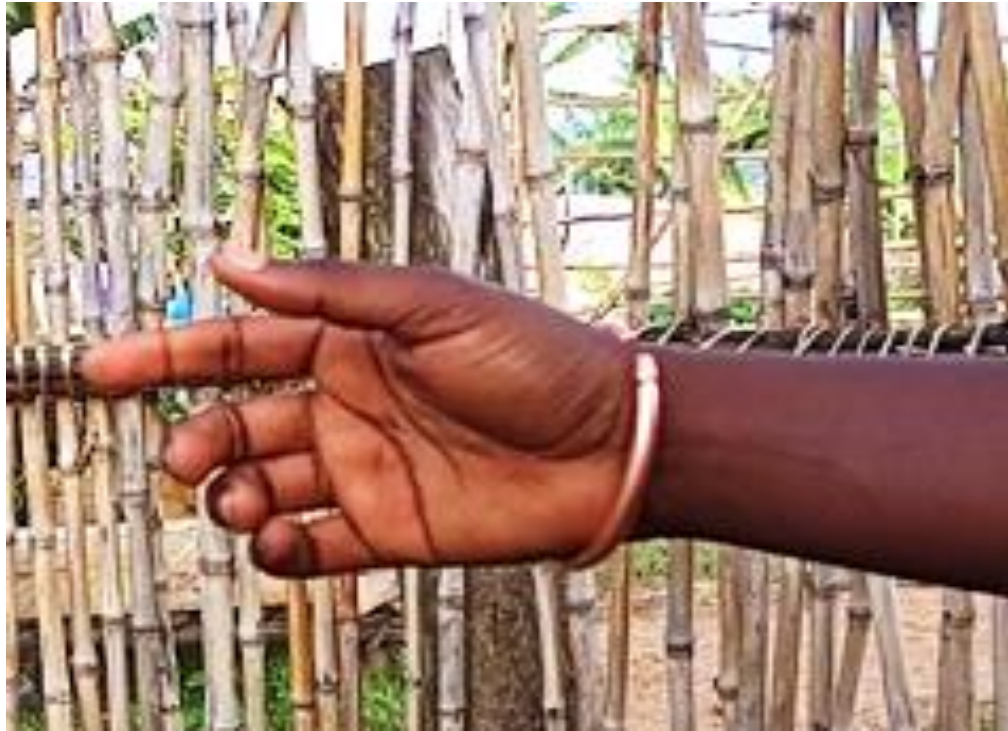
Figure 20: A bangle (omuringa) worn by one of the believers

Prophecy is a common characteristic feature of Bachwezi Bashomi assemblies. Prophecy is done by Abarangi (mediums) and it is in born (Oweishemwe 2023). One of the enduring prophecies perceived through oral tradition is that of Kakara ka Kashagama Kamangu's prophecy about the disappearance of the mystical Bachwezi and the transition into the present Bachwezi realm. This was during the reign of Ruhinda rwa Njunaki the first human king after Bachwezi (Prince Tugume 2023), which forms part of the mythical aspects of the religious movement. Some of the Abarangi who are prophets in Bachwezi Bashomi include Omurangi Barigye and Omurangi Mulema , who also serves as the overall leader of the Bachwezi Bashomi.