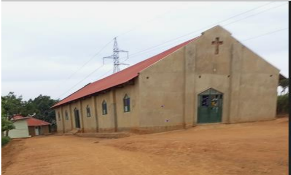
Figure 5: Ekanisa y’Obusingye in Kiruhura

The Church of peace, as indicated in the picture above is constructed in the architectural design of contemporary Christian church with mark of a cross. The cross is a symbol of Christianity (Benson 2013, Mustafina and Borbassova 2020). Furthermore, at Omukageeti , Kiruhura district the church has a primary school where children are offered formal education together with the rudiments of Bachwezi-Bashomi doctrines, the reality that is similar to early missionary churches and the education institutions in Africa.