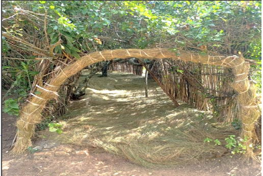
Figure 2:Ekigabiro in Kiruhura

Figure 1 and Figure 2 are Ebigabiro which are improved or renovated. They are both sacred places found in Mbarara and Kiruhura respectively.