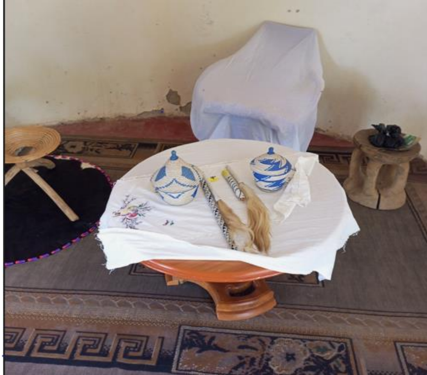
Figure 12: Inside the Nyaraju, covered with white is the seat of the diviner.