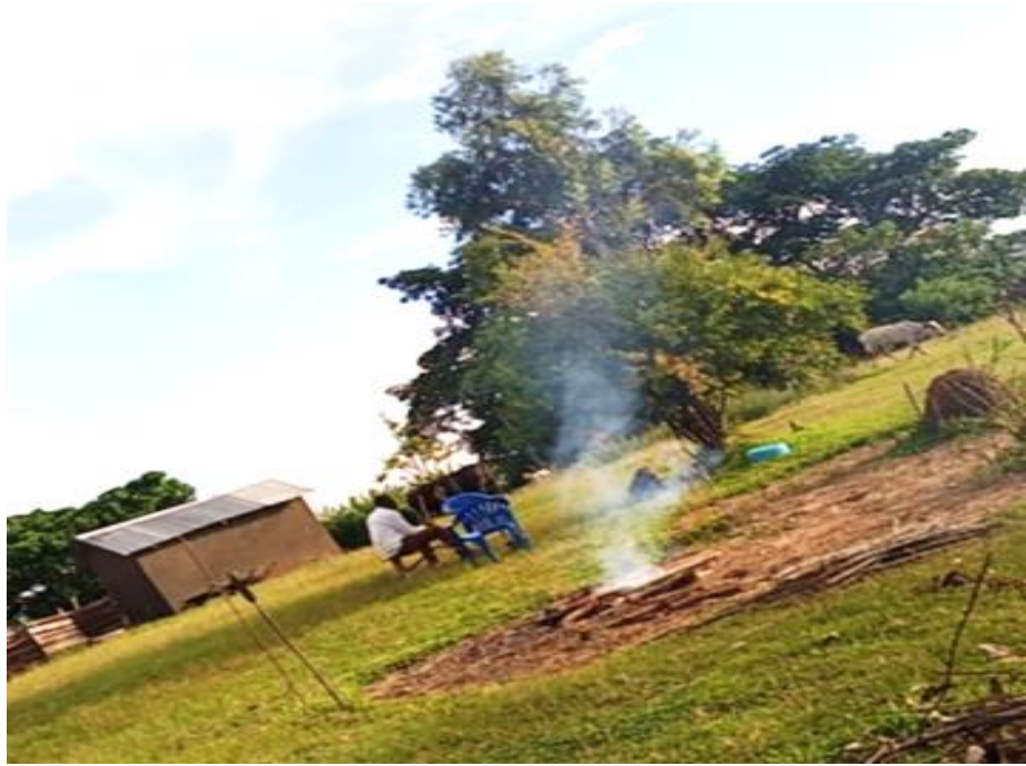
Figure 18: Fire being made at Itaaba when it approached 5:00pm with the spears around the fire place as directed by the spirits.

Respondents mentioned that there are several special ceremonies carried out by Bachwezi Bashomi. The ceremony of Omuhasiriro (nights of Blessings) stands out (Tugume 2023). According to one respondent, some hold such ceremonies on every 4th of the month whereas others hold the same as revealed by the angels / holy spirits (Bachwezi). During this ritual, the leader prays for the believers. On each believer seeking healing or deliverance, the leader places Ikinga (a white tail of an animal with a handle made of beads on the table), while uttering words.