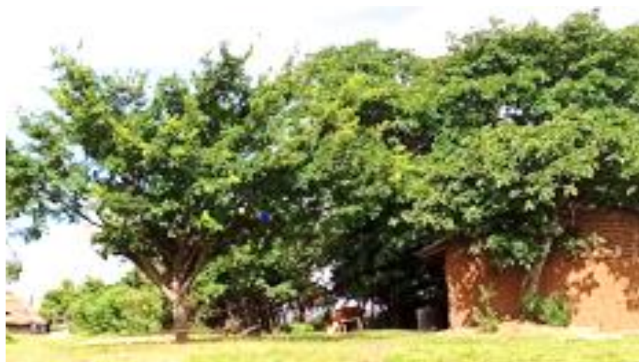
Figure 15: Omutooma (bark cloth) sacred tree at Itaaba believed to be as old as Omuchwezi Wamara from where he crafted Bagyendanwa the sacred royal drum

They practice divination and healing. Followers combine modern pharmaceutical treatments with natural herbal practices to treat diseases. The major focus on wellness about Bachwezi Bashomi is preventing harm and diseases from people (Mpairwe 2023). This seems to be the essence their call for peace ( obusingye ). Obusingye cuts across interpersonal relationship to include good relationship with the spiritual reality, and physical and psychological contentment. Nature in this case is harnessed to human health and wellness. The Bachwezi are believed to heal and maintain human health balance through nature like plants and waters. This is what informs the practices and beliefs in the power of some trees like Nakayima tree in Mubende and others like Omurinzi Omugorora in figure 17 and omutooma in figure 15 below.