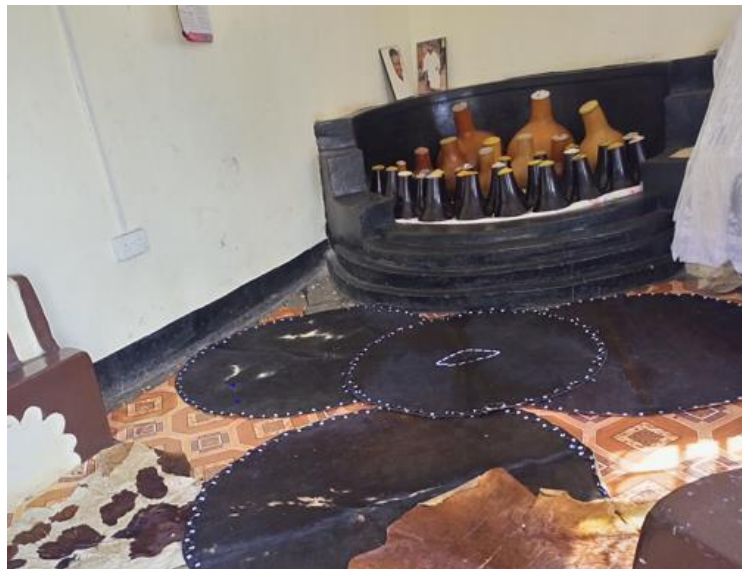
Figure 13: Where milk gourds are assembled is the Ruyegye where the Bachwezi are fed.

The life style of Bachwezi-Bashomi is ample subject to the economic status of an individual. They are not secretive, and easy to go people. They participate in