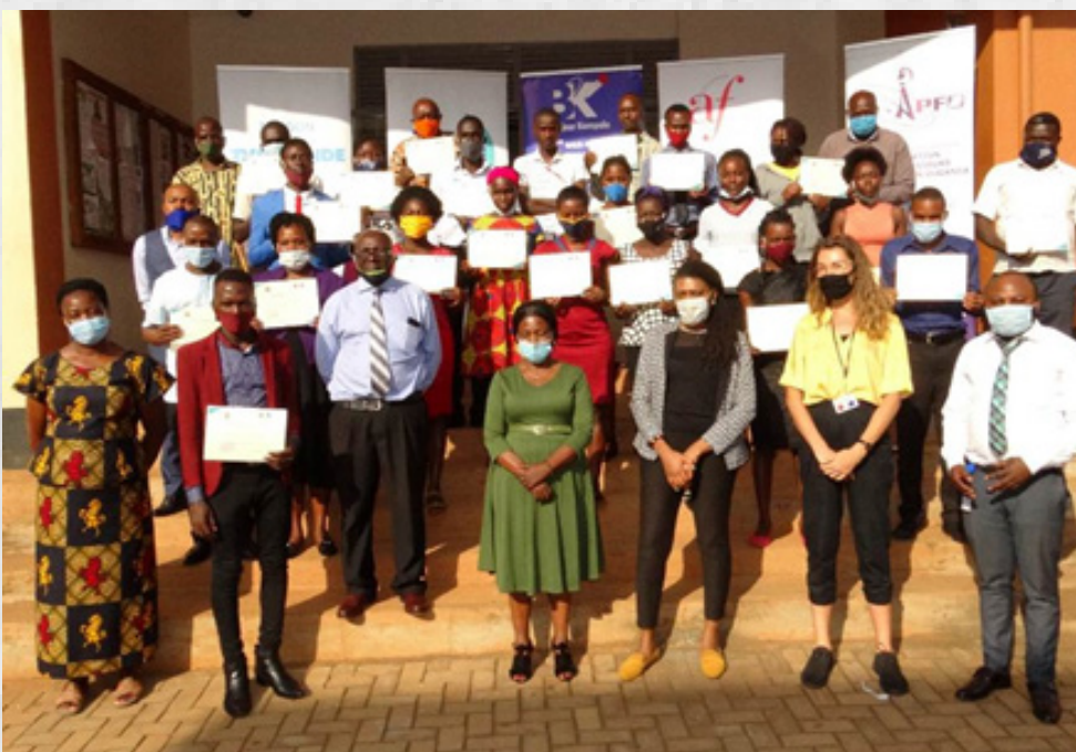
Group photo at the closing ceremony