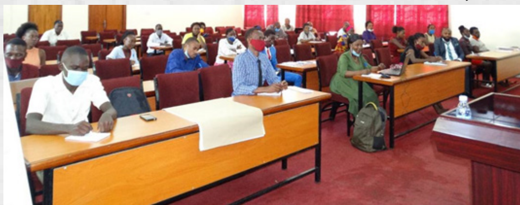
Participants at the workshop

The learners had a hands-on interaction on the