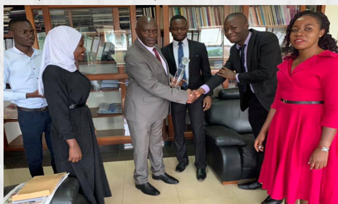
Kyambogo's Chartered Financial Research Challenge winning team meets the Vice Chancellor.