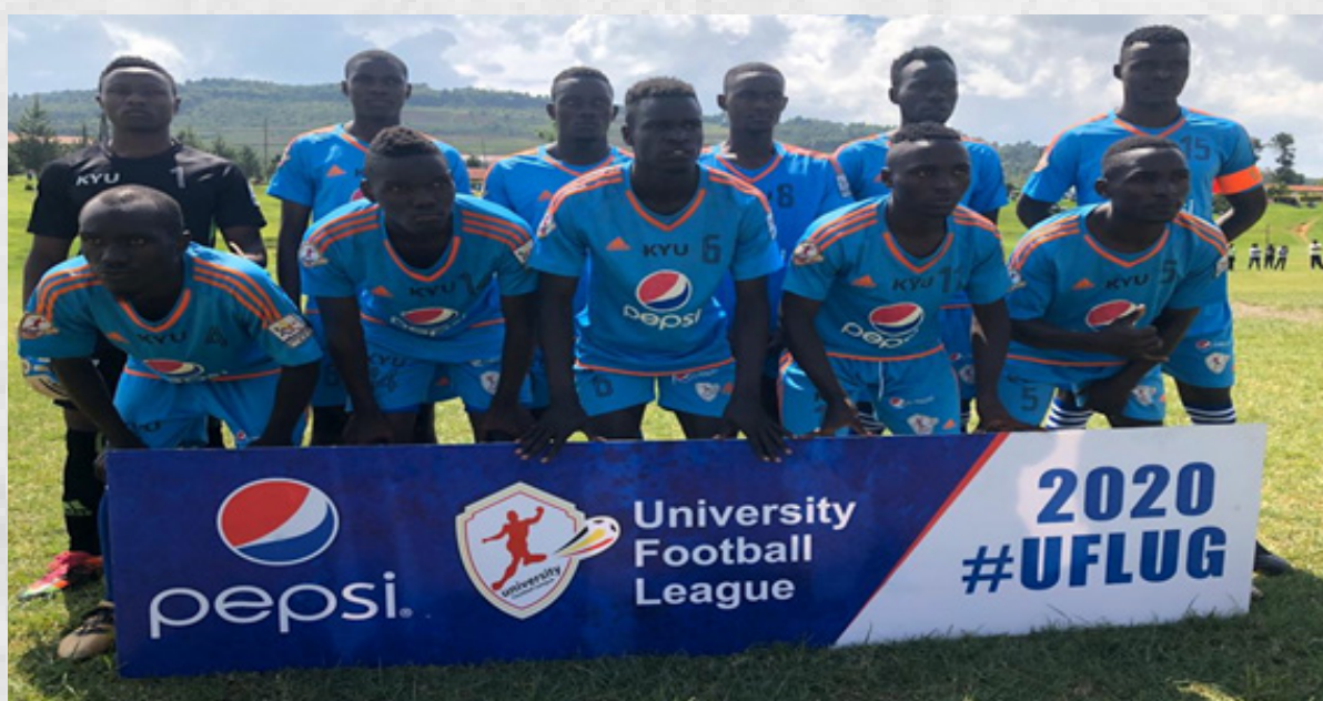
KYU Football team pose for a group photo before their first University league game with Kabale University on 16th February 2020 at Kabale University playground.

Kyambogo University took the Pepsi University league trophy in 2018 and the last year league saw them get eliminated by Bugema University in two heavily guarded matches at Bombo playground but the Head Coach believes that this season will be enormous for them.