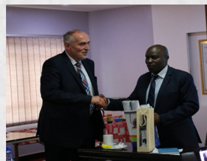
Vice Chancellor Kyambogo university exchanging gifts with the President, University of Applied Sciences, Mainz

Dean of SOME and head of international relations office had visited the university of Mainz and this was a return visit.