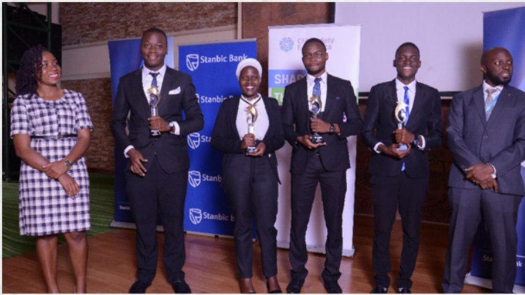
The Winning team celebrating their victory

O n Tuesday 4th February, Kyambogo University topped Ugandan Universities after winning the Chartered Financial Analysts (CFA) Challenge 2020 finals held at Golf Course Hotel, Kampala.