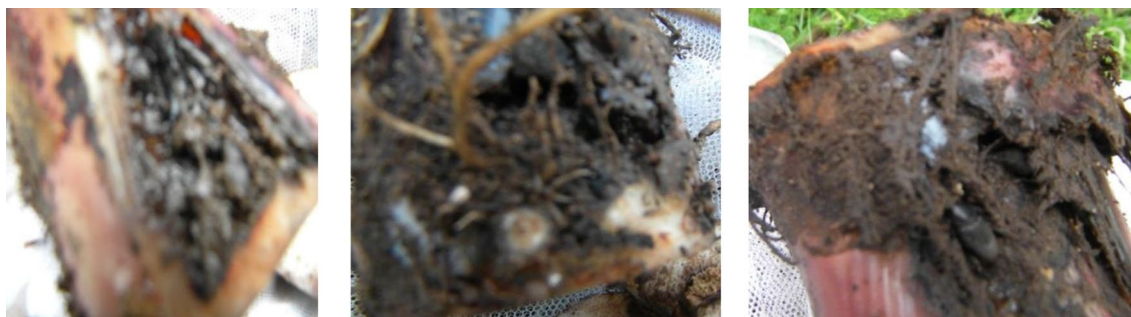
Fig. 4 Representative banana pseudostems showing above the collar damage caused by banana weevil collected from different sites

The results showed that there are low peripheral damage (PD), low total cross section damage (XT) and no ACD caused by weevils from western Uganda and this explains why the yield loss caused by banana weevils in western (Mid-west and Southwest regions) Uganda is negligible. The report [20] is in agreement with these findings. Western region had the highest yield of banana in Uganda at 6.0 metric tons/hectare, whereas banana weevils collected from central (Wakiso and Mukono) and southern Uganda (Masaka and Rakai) caused significantly very high ACD as compared to the weevils from western Uganda (Mid-west and Southwest regions).