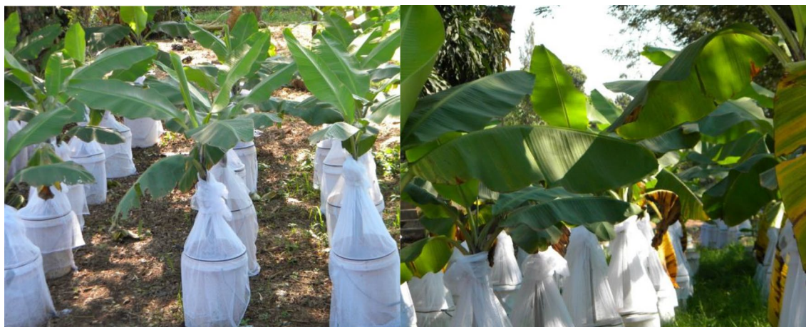
Fig. 1 Potted banana plants wrapped in buckets after introducing adult weevils