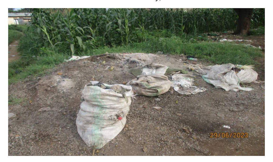
Plate 1. Poorly disposed ashes packed in gunny bags (2023)