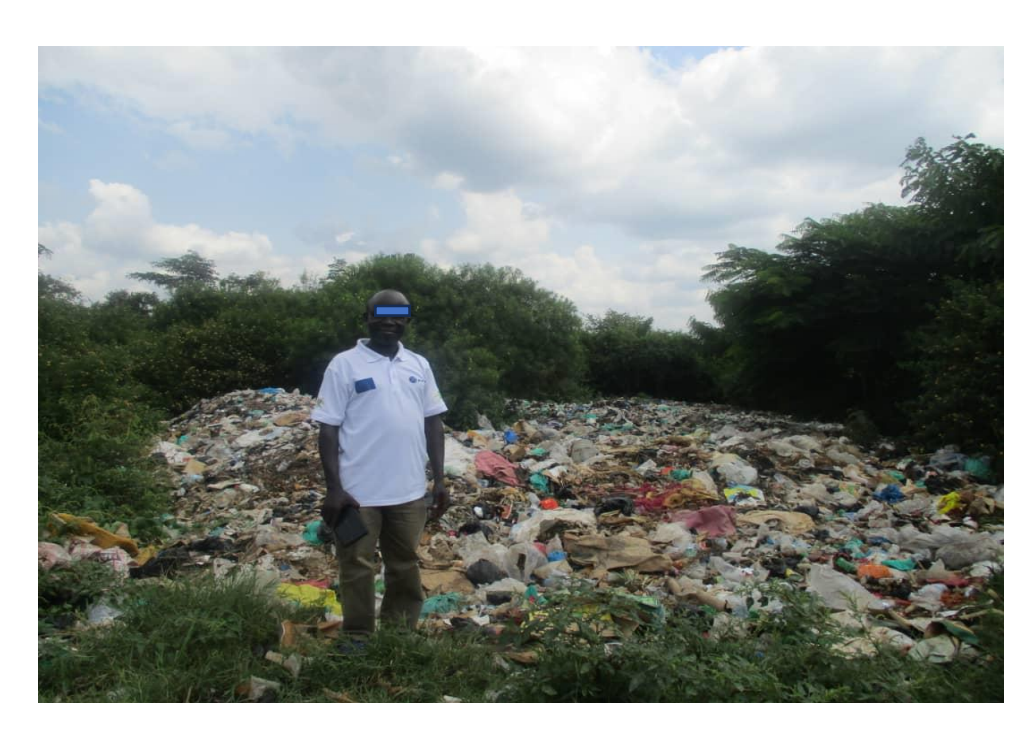
Plate 2. A Heap of wastes dumped on land (2023)

The prevalence of open waste burning and burying is often linked to the lack of accessibility to formal collection services and a limited awareness of the environmental consequences associated with these practices [33; 31]. In the central ward, such practices are common, as many residents perceive open burning as the easiest method for disposing of non-organic solid waste. This finding highlights the challenges and informal strategies adopted by the community in managing solid waste, emphasizing the need for improved waste disposal infrastructure and environmental education. In relation to this finding, one of the key informants had this to say: